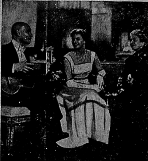
"Anastasia," Truly Magnificent Drama: Berman, Brynner, Hays - All Superb

They claimed, however, that major companies still are "mis-using" much crude oil by refining it into gasoline, unneeded here and unwanted abroad. And independents still have marketing problems, they said, renewing the charge that major buyers have denied them sufficient pipeline connections to their wells.