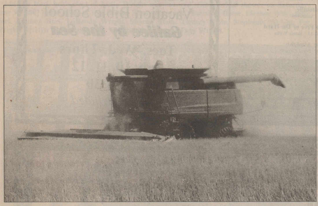
An exceptional wheat harvest is nearing completion in Sherman County