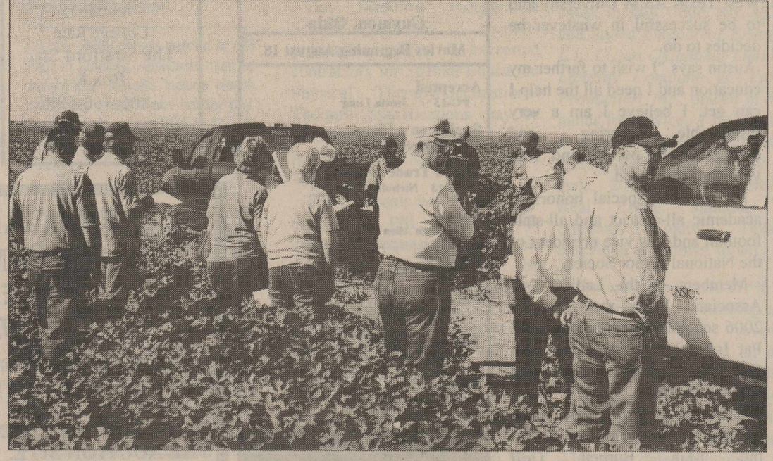
Shown above and below are some of the local area producers and seed dealers that enjoyed the Sherman County Cotton Turnrow Meeting on Thursday, August 10, 2006

Texas Cooperative Extension provides relevant researched based programs. If there is anything that I can do for you please contact me at 366-2122.