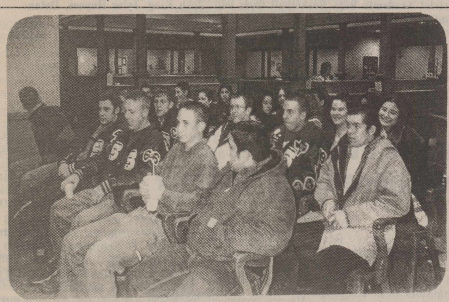
Job Shadow Day Held

Twenty-seven Senior Students participated in the 4th Annual Job Shadow Day on Tuesday, February 25th. See story on page 2.