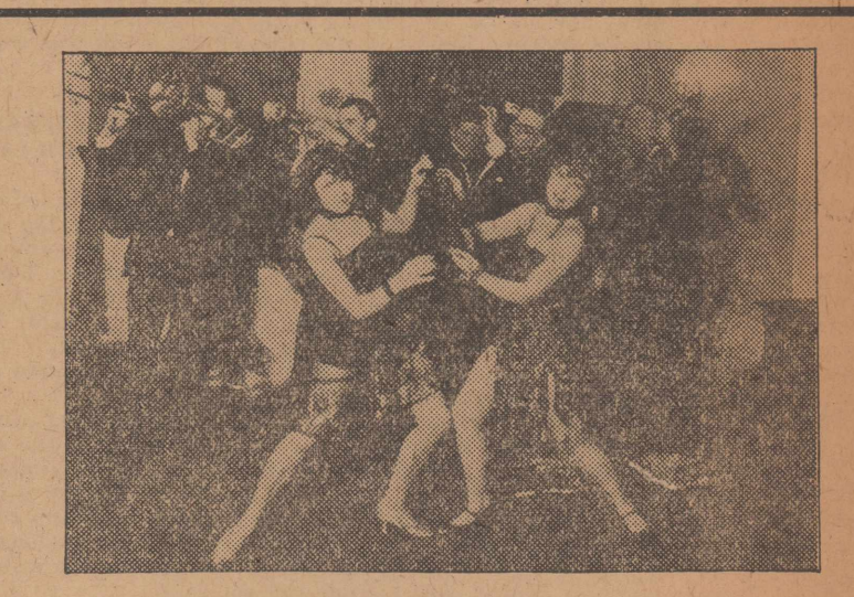
Don't Fail to See the

The Choral Club of Floydada will Club announces that there will be a give a program at the High School number of religious numbers as well A large attendance is expected and 6th under the auspices of the Senior arrangements have been made to make