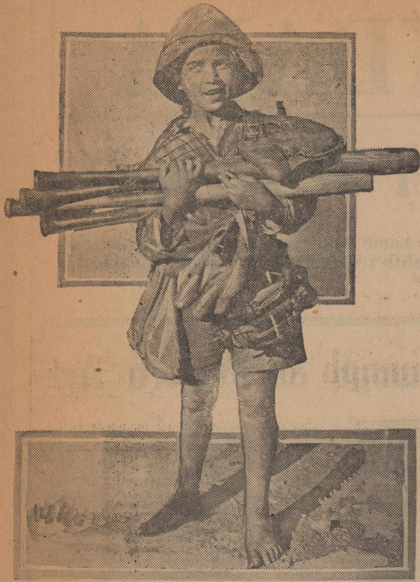
A Levantine Babe Ruth in Embryo

AGE old hatreds, religious bigotry, and racial intolerance literally are being knocked out of the Near East, where for centuries they have bred strife, bloodshed and misery. More than 150,000 children who have been admitted into Near East Relief orphanages in Greece, Palestine, Armenia and Syria during the past eight years have been taught American sports and American sportsmanship. These have been the primary courses in the lesson of Golden Rule conduct so essential to bring a new era of peace and good will to that part of the world. "Few of the children whom we brought into our orphanages and training schools knew how to play," one relief official reports. "They had been forced from a very early age to fight against the forces of man and nature for their very existence. They had no time for relaxation. They were young two-legged animals.