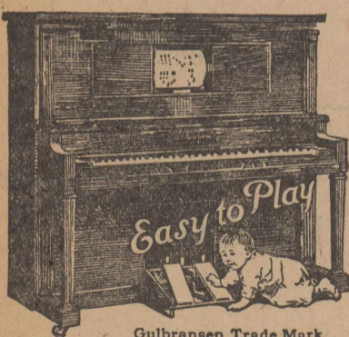
Gulbransen Trade Mark

KODAKERS Bring us your films today And get your prints tomorrow. WILSON STUDIO