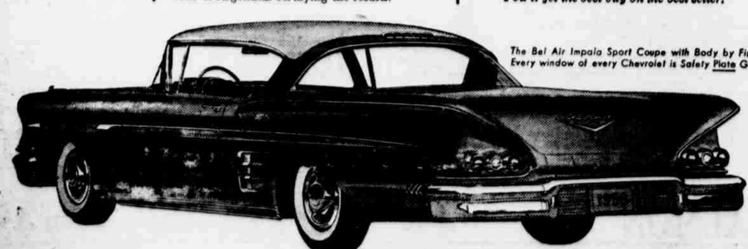
The Bel Air Impala Sport Coupe with Body by Fisher. Every window of every Chevrolet is Safety Plate Glass.

3 SPECTACULAR VALUE - Your Chevrolet dealer's ready to prove it! He'll show you that Chevy's the only completely new car in its field, today's biggest dollar buy. Yet prices begin right at the bottom of the ladder. See him this month for sure!