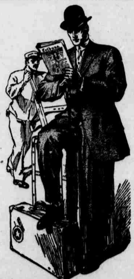
Copyright 1907 by Hart Schaffner & Marx