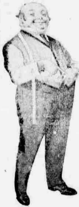
COPYRIGHT 1917 ED. V. PRICE & CO.

expressly for you here at home, but a local tailor shop today is impractical and unprofitable.