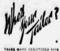
TRADE MARK REGISTERED 1918