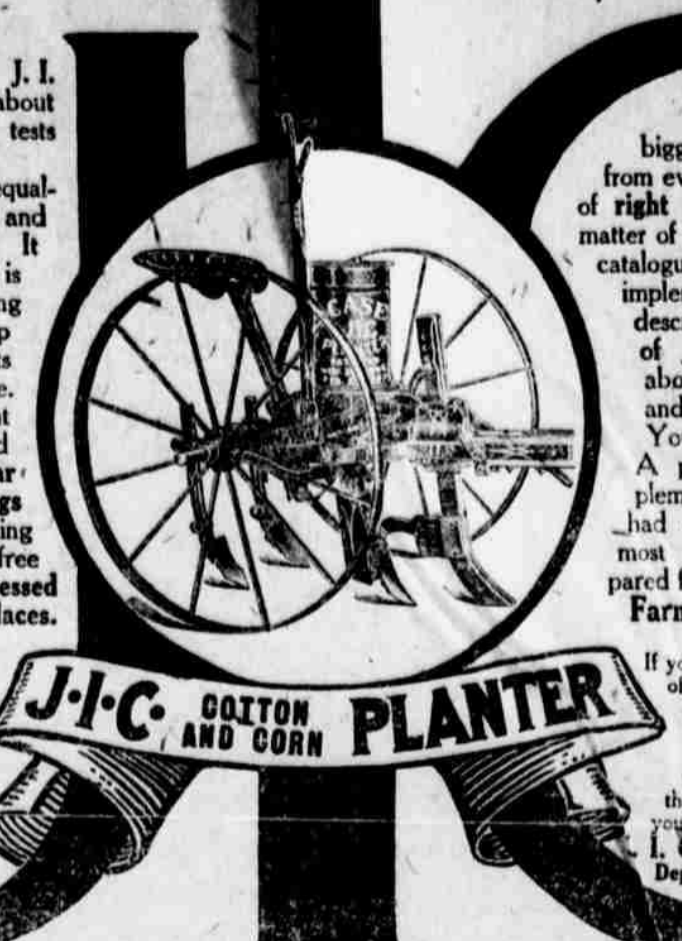
J.I.C. COTTON AND CORN PLANTER

When shovels are locked down the drawing of the main lever which lifts the sweep standard also unlocks and raises the covering shovels and the furrow shovel.