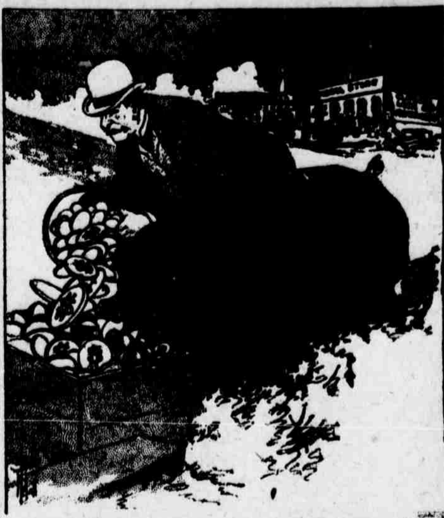
Are you, Mr. Resident of This Community, feeding to the snail and hog the dollars of this community? Are you pouring the money that should stay in the home town into the trough from which the gluttonous hogs of the city feed? If so you are doing not only the town, but yourself, an irreparable injury, and one that you should stop at once.