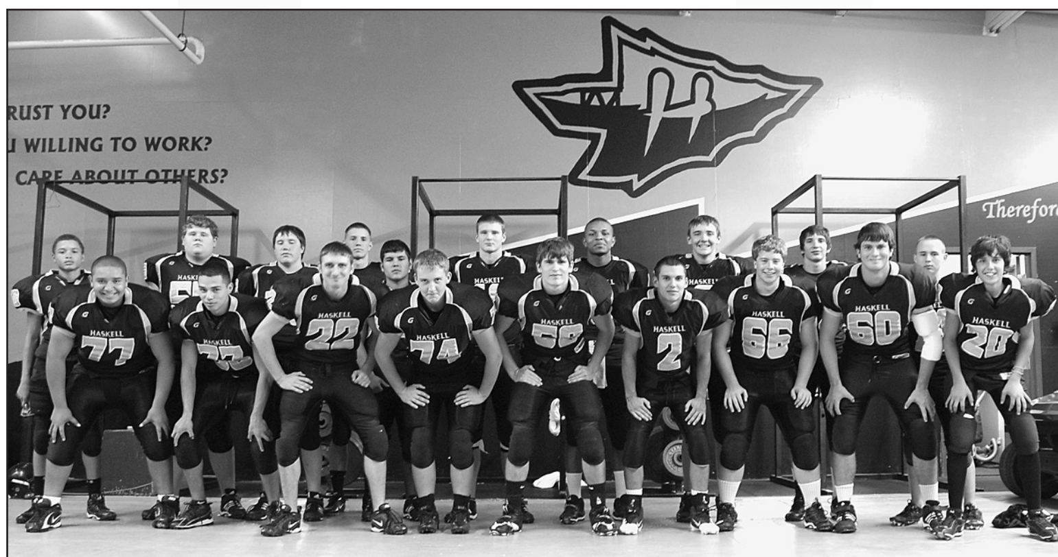
2011 HASKELL INDIANS