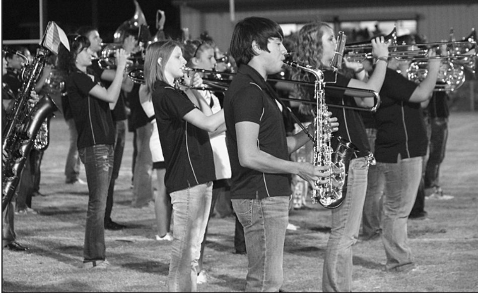
BAND PERFORMS —The Haskell Indian band performs during halftime of the Indian vs. Rotan football game.