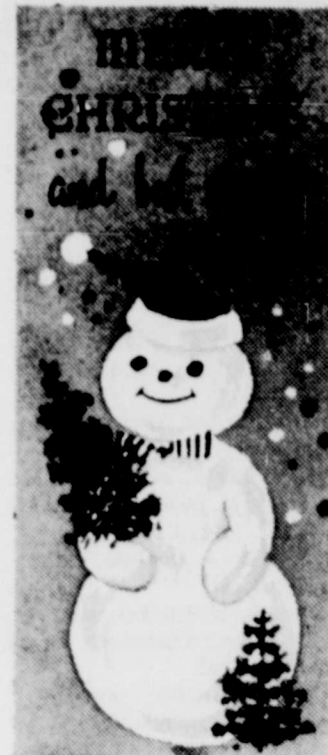
FRANCES FABRICS Olney, Tex.