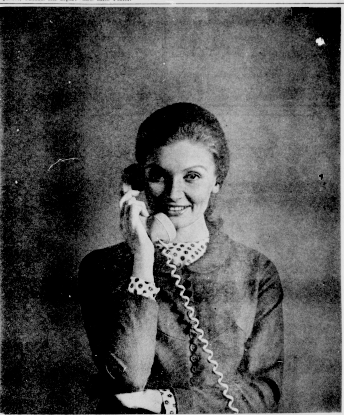
Our customer's representative is a good listener

satisfaction and to fill your order correctly. Turn In Your Order at The Office of This Newspaper