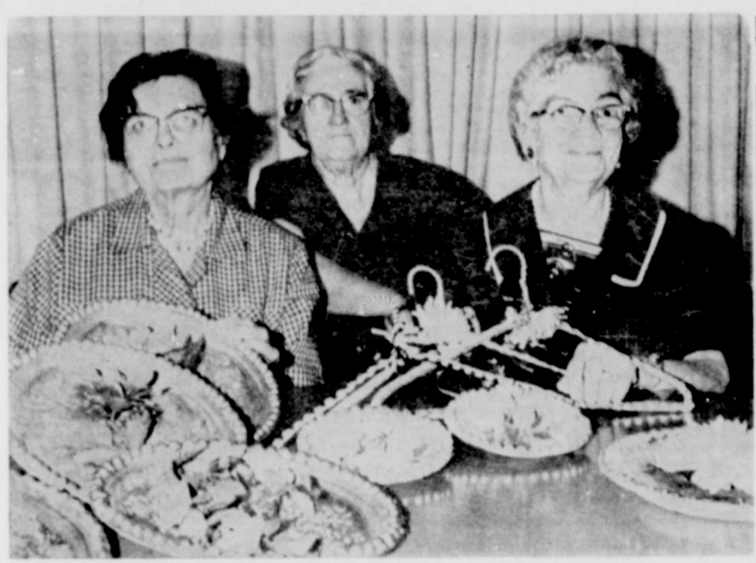
DISPLAY CRAFTS - - These three residents of Hillcrest Haven are shown with their handicrafts which they made. Using their