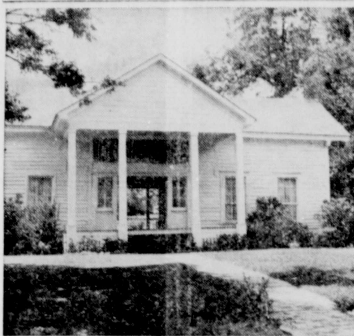
SAM HOUSTON'S HOME —Thousands of visitors to historic Huntsville each year make a pilgrimage through this white cottage which was once the home of the famous Texas statesman. The house is part of the Sam Houston Shrine located across from Sam Houston State College. Other points of interest here include a museum containing clothing, weapons, books and rare documents owned by Houston. Nearby is his old log law office and the frame building shaped like a steamboat in which he died.