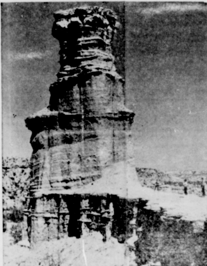
LIGHTHOUSE ROCK—Sculptured by wind and water, this natural stone tower keeps its vigil near Palo Duro Canyon State Park, 35 miles southeast of Amarillo. Palo Duro Canyon is a spectacular 120-mile gash through the Texas Panhandle, 10 miles wide and more than 700 feet deep, the canyon is considered one of the truly geological wonders of the state.