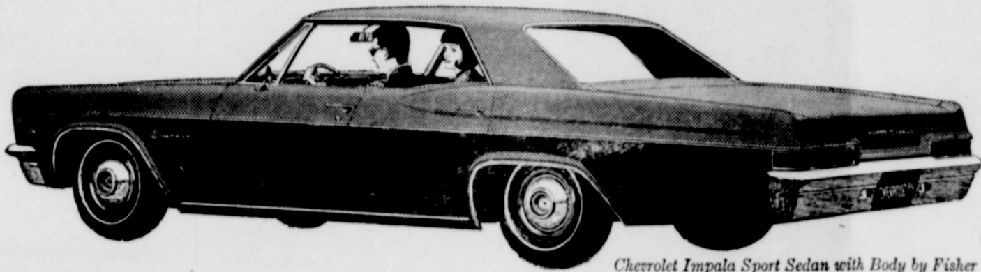
Chevrolet Impala Sport Sedan with Body by Fisher