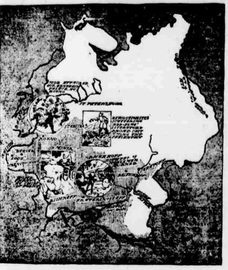
The provinces in arms against the Czar's rule are shaded on the map. Fifteen cities are affected, as follows: