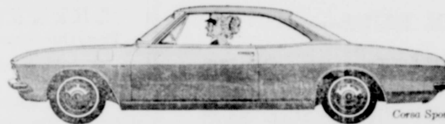
'65 Corvair It's racier, roomier, flatter riding. With more power available—up to 180 hp in the new top-of-the-line Corsair.

More to see, more to try in the cars more people buy Order a new Chevrolet, Chevelle, Chevy II, Corvair or Corvette now at your dealer's