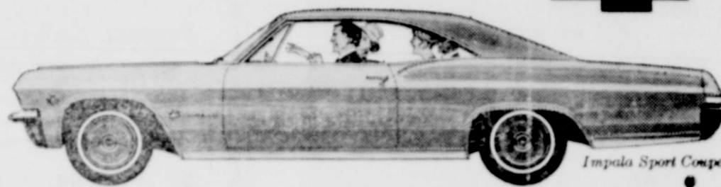
'65 Chevrolet It's longer, wider, lower. It's swankier, more spacious. You could mistake it for an expensive car—if it weren't for the price.