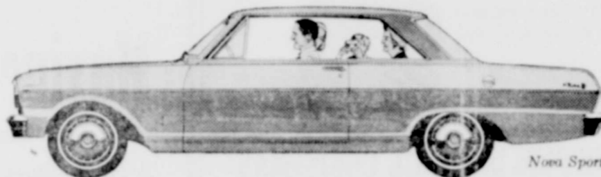
'65 Chevy II Clean new lines. Fresh new interiors. A quieter 6 and—V8's available with up to 300 hp. Thrift was never so lively.