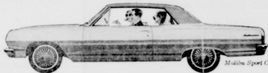
'65 Chevelle Fresh-minted styling. V8's available with up to 350 hp. A softer, quieter ride. And it's as easy-handling as ever.