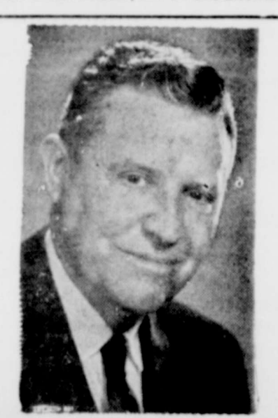
Senator Ralph Yarborough Easy winner over his Republican opponent.