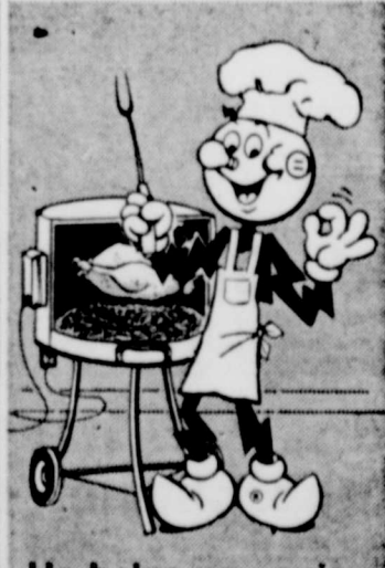
He not only saves you time and work