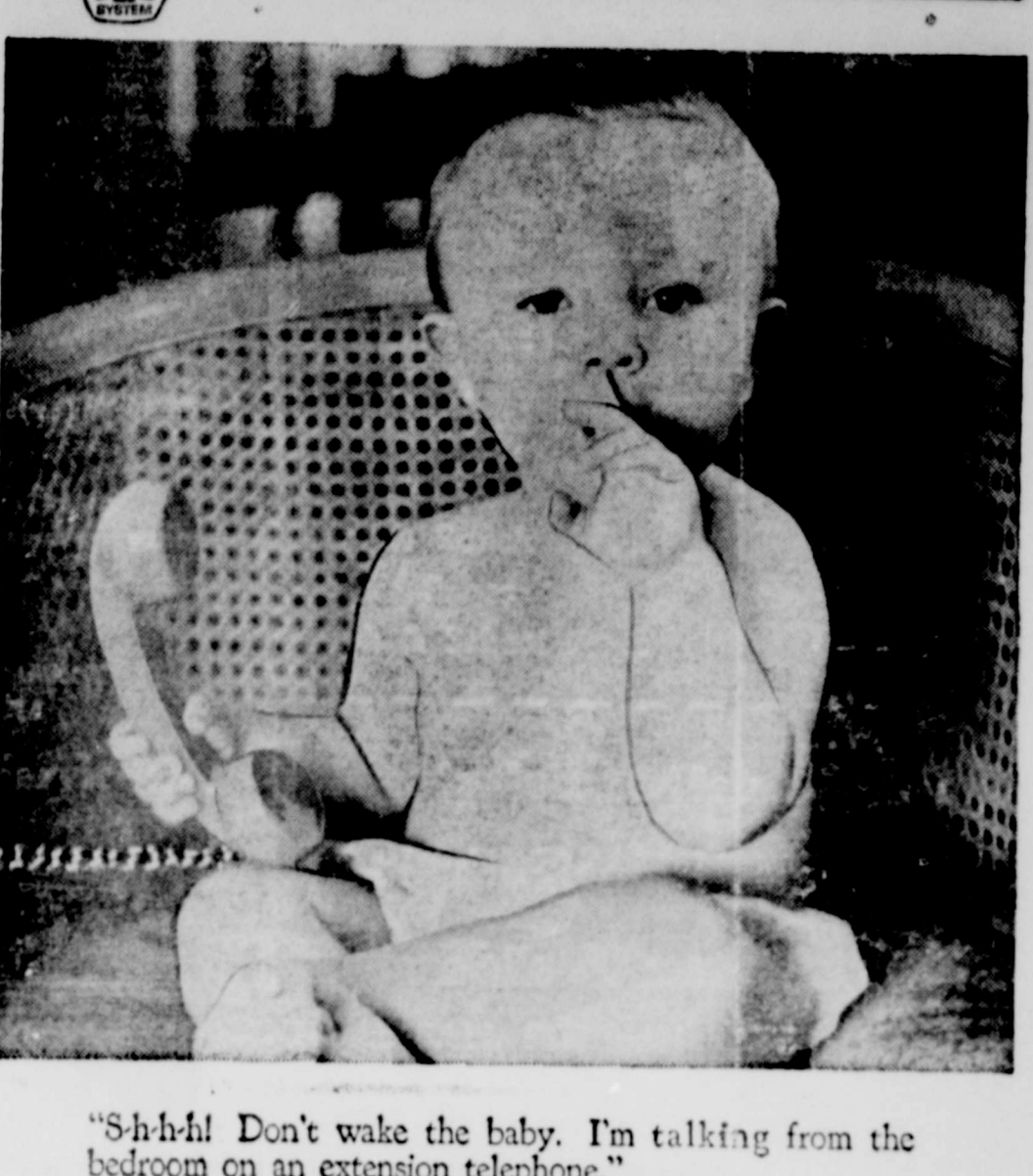
bedroom on an extension telephone.

FEDERAL DEPOSIT INSURANCE CORPORATION WE APPRECIATE ANY BUSINESS ENTRUSTED TO US