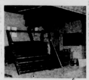
Two-inch pipes welded across H-beams make effective cattle

ANSWER: A simple method of construction for a cattle guard is to weld lengths of old 2-inch pipe across H-beams. The length of the cattle guard should be at least 6 feet. If it is necessary to make it longer than 10 feet, we recommend making the guard in two sections for easier lifting. with a 11/2-inch pipe slipped through the inside of two sections to hold them together. Lifting is essential, of course, in cleaning out the cattle guard. The H-beams should be placed 2 to 3 feet apart and you'll need three to five beams, depending on length of the guard.