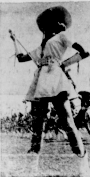
COLORFUL PRECISION MARCHES will be performed by Kilgore Junior College Band, of Texas during the Navy-Texas game in the Cotton Bowl.