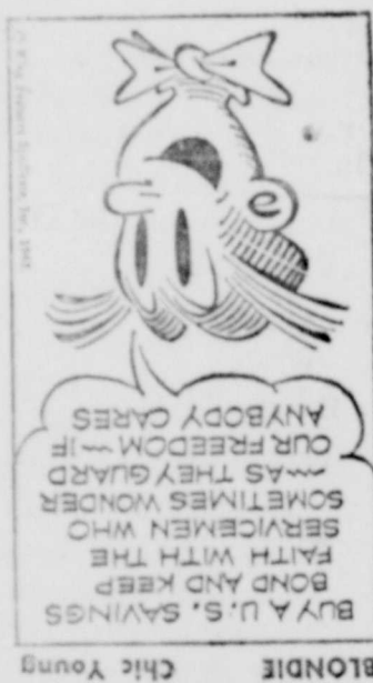
BLONDIE Chic Young