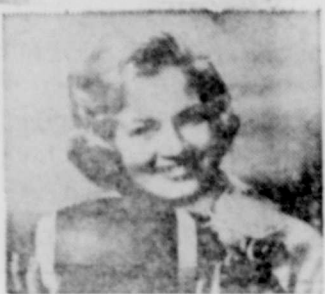
DIANE SAWYER, 18, America's Junior Miss will reign as Senior Bowl Queen, Mobile, La.