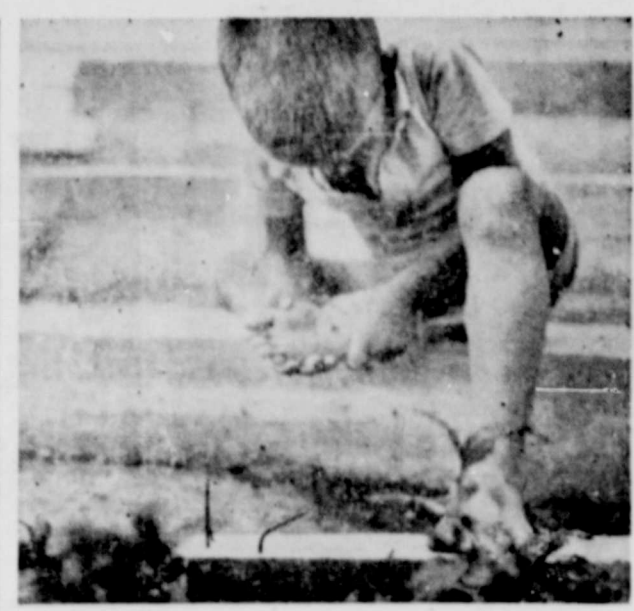
Puncture wounds are a common cause of tetanus.

seeds or spores can. Tetanus spores are usually of the country are nearly as scrapes and falls of childhood produced by bacteria growing common as dirt, and await only offer tetanus many opportunities. within the air-free intestinal the right kind of wound to start