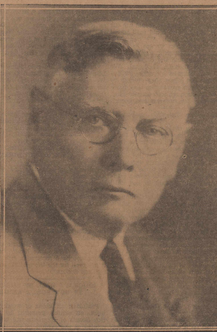
Governor Ross S. Sterling