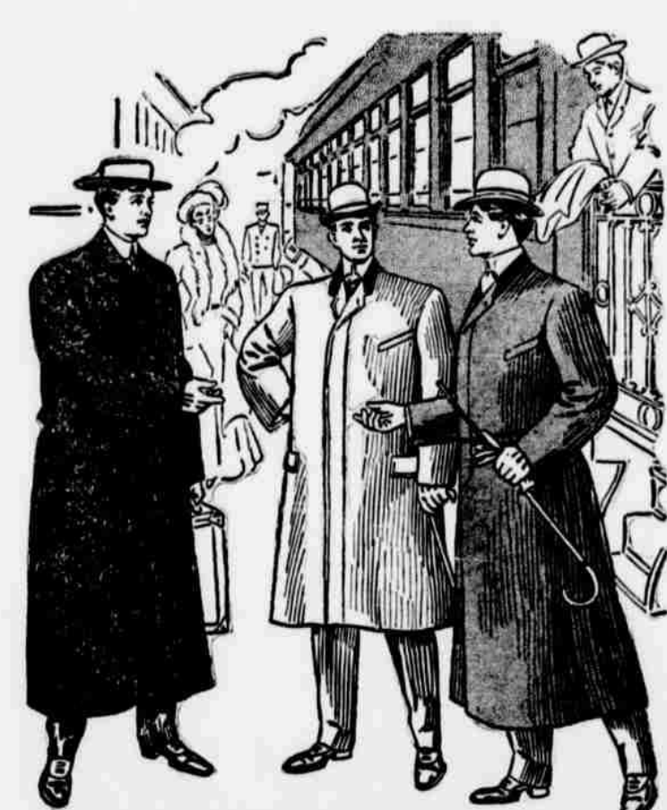
COPYRIGHTED 1904 BY CROUSE & BRANDEGEE. UTICA NEW YORK

That's why our clothing is hand tailored at every point where it possibly can be an advantage in shaping and holding shape. That's why every suit and overcoat that goes out of our store adds to our reputation for good clothing.