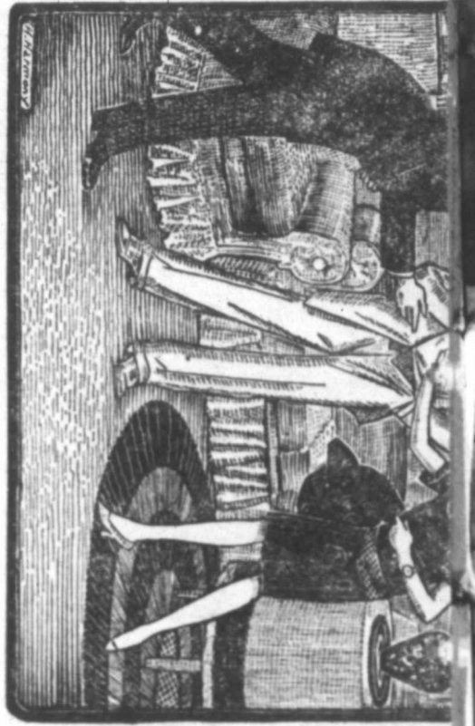
"Miller, This is Little Name."

Use Blue Star Soap, then apply Blue Star Remedy for Eczema, itch, letter, ringworm, poison oak, dandruff, children's sores, cracked hands, sore feet and most forms of itching skin diseases. It kills germs, stops itching, usually restoring the skin to health. Soap, 25c; Blue Star Remedy, $1.00. Ask your druggist.—Adv.