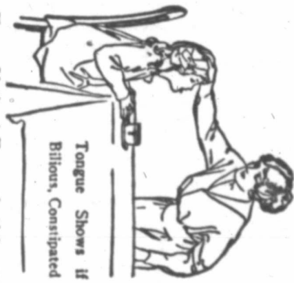
Tongue Shows If Bilious, Constipated

Child's Best Laxative is "California Fig Syrup"