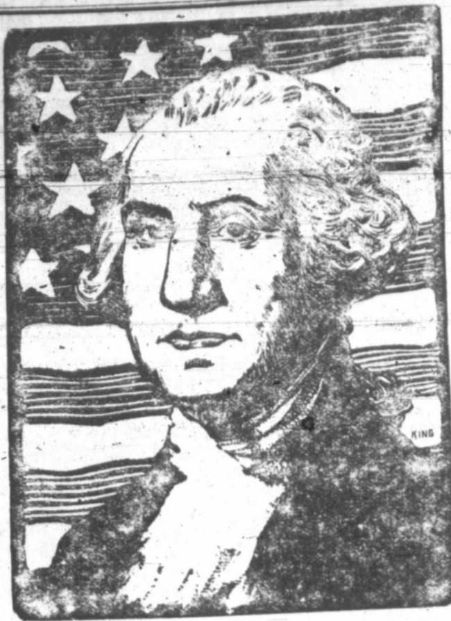
THE FATHER OF THE THRIFTY

The home talent play "The Sweet Family" at the school auditorium Monday night given by the ladies of the Central Baptist Church, was a decided success, according to reports from all who attended. "The Sweet Family" are real entertainers.