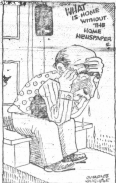
Oh, Look at the Briny Weeps! The Man feels Bad. Four Times he's Got Sore and Stopped his Paper. Each Time he Cooled Off and Ordered it Started. But Now the Editor is Mad and Won't Send him the Paper. Just a Fairy Tale, of course, but with a Moral.