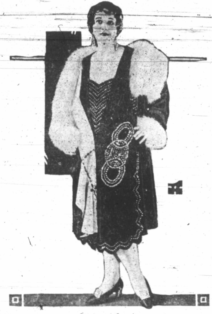
Ornate and Queenly.

What pranks tucks are playing in fashion's realm this season! No more of "the straight and narrow path for them!" Possessed with a which have made their appearance I feeling of "wanderlust" tucks are run-