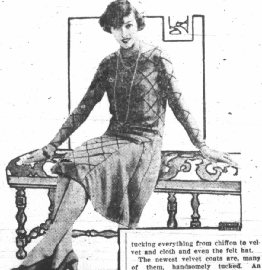
Tucks in Pretty Confusion.

Now that designers have found out the possibilities of tucks, they are