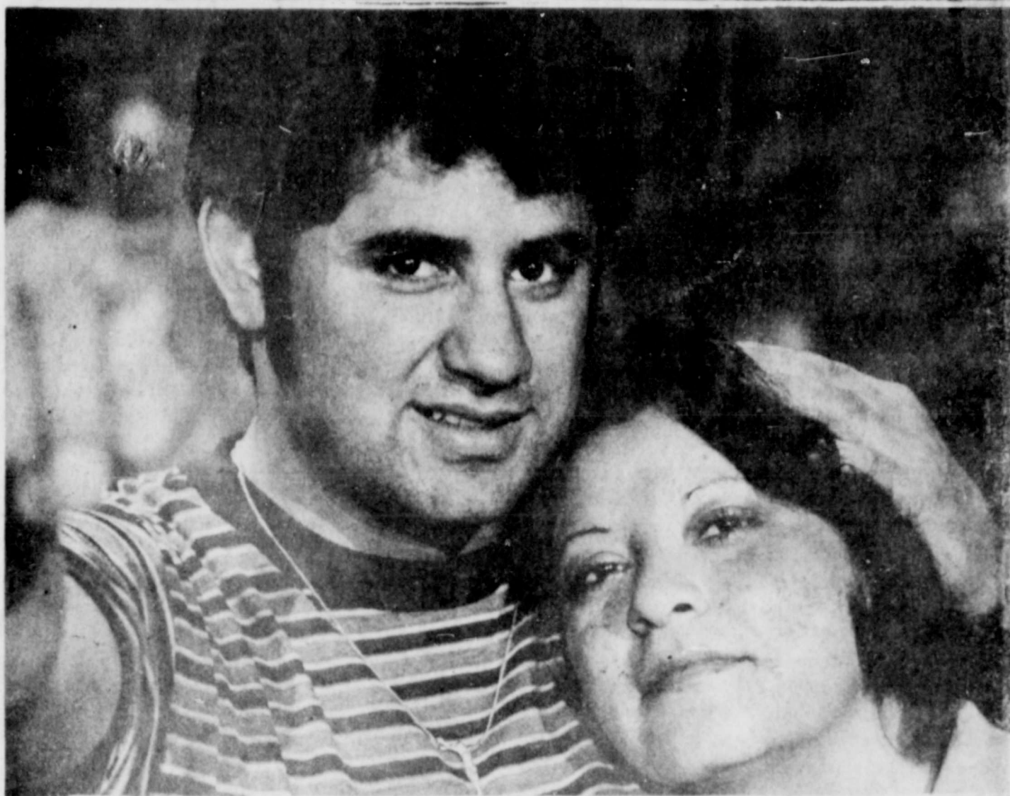
ESTOS SON DOS DE LOS ACTORES DE EL GRUPO DE TEATRO "LOS POBRES"