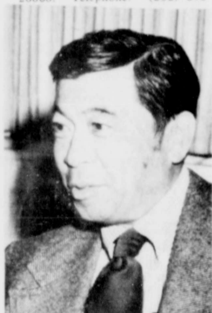
OWAN: 'We hope program will grow.'