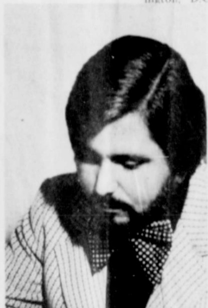
DE LEON: 'We accomplished our goals.'