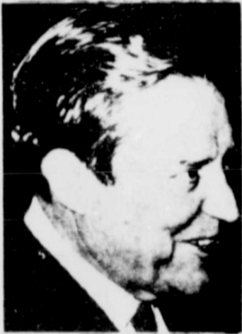
YARBOROUGH SPEAKS OUT

In a recent West Texas conference, Senator Ralph Yarborough stated, "In America, we have the concepts of health industry, not health care."