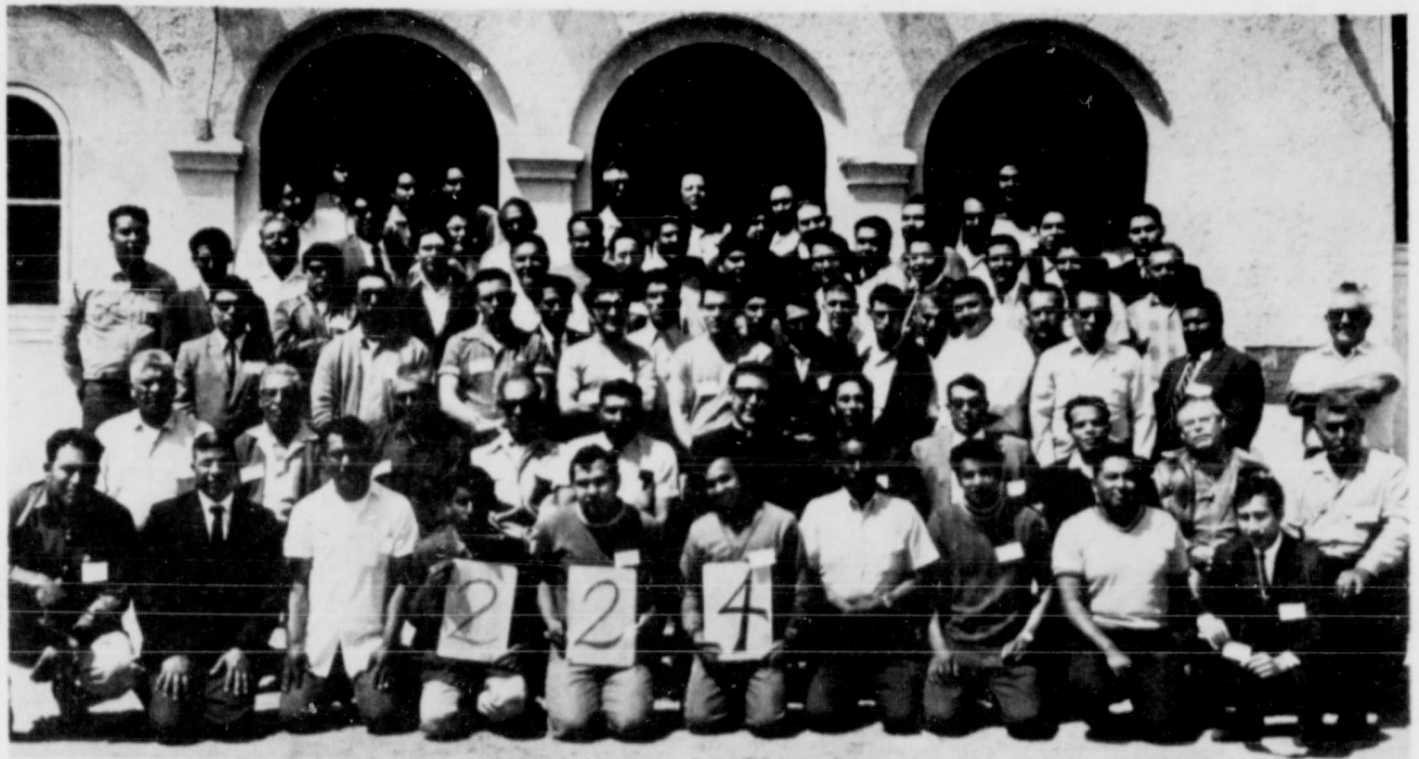
The Committee of 70? Not quite. These are 70 of the brand new Cursillistas who lived their Cursillo in Hereford, Texas this past week.

Ninguna altombra pequeña debe colocarse sobre una superficie resbaladiza, sin tener alguna clase de base o acolchado que no resbale.