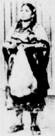
La India Maria