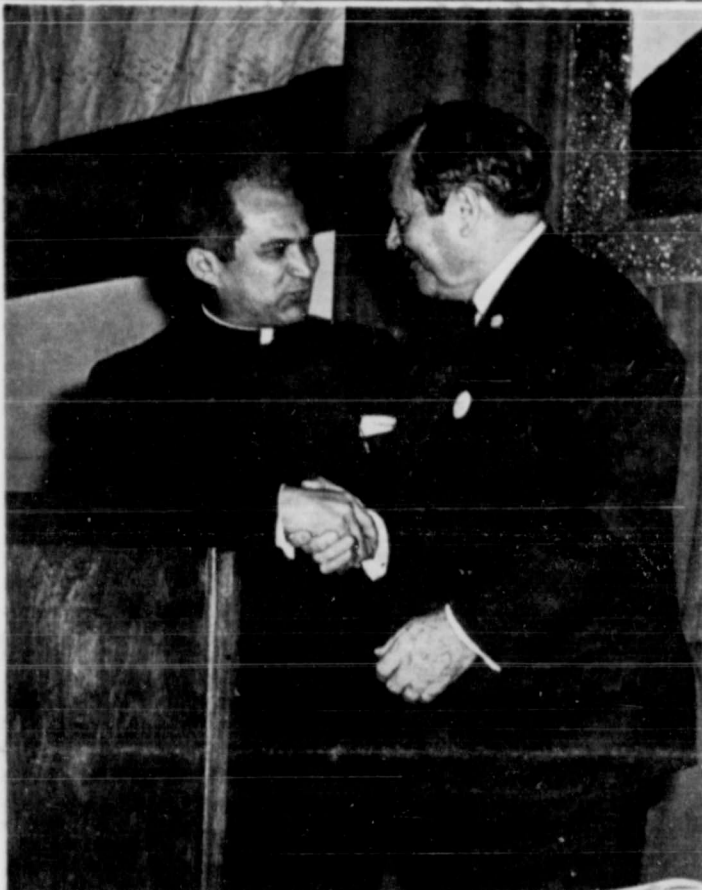
His Excellency and the Senator

A new Bishop and an old friend. The Most Reverend Bishop Patricio Flores and the Senior Senator from Texas — Ralph W. Yarborough.