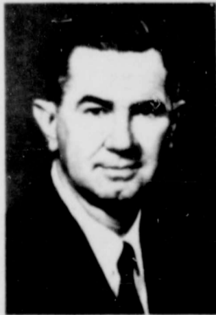
JUDGE JAMES DENTON