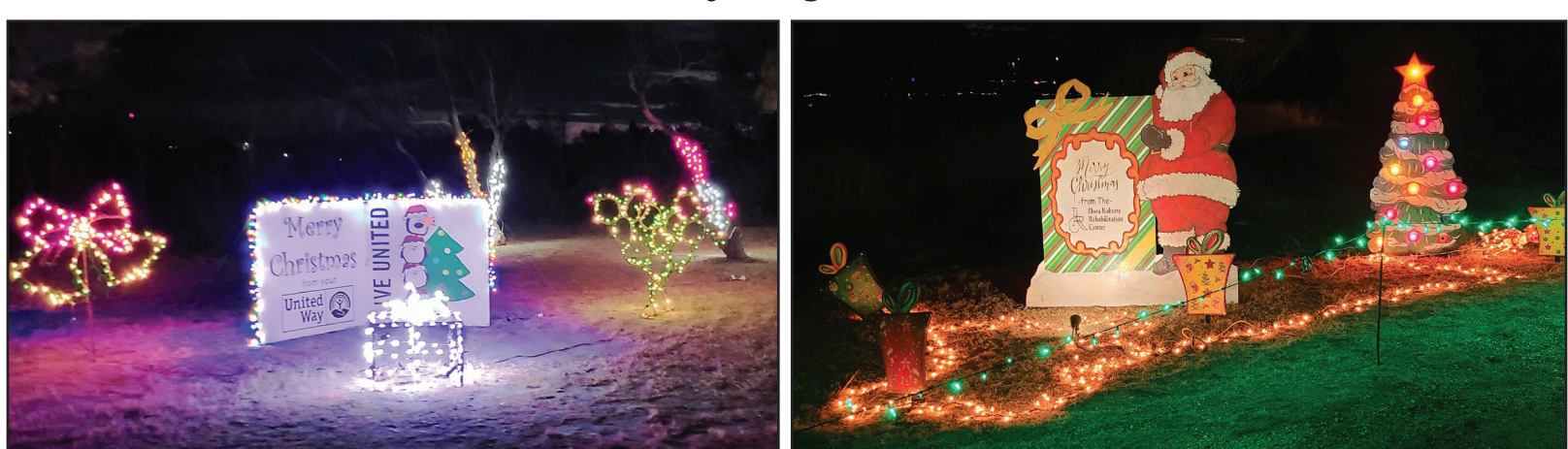
The Comanche Trail Festival of Lights has blazed brightly in Comanche Trail Park this December, but this weekend it will all be over until next year.