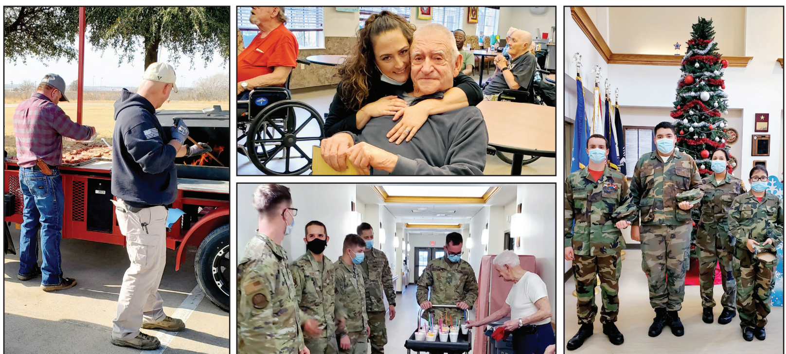
At left, KRP Rentals donated use of the grill, as well as the cooks, to grill 125 ribeye steaks for the residents of the Lamun-Lusk-Sanchez State Veterans Home Friday. Top center, Lamun-Lusk staff and residents enjoyed the festivities. Bottom center, servicemen from Dyess Air Force Base in Abilene brought a snow-cone machine to make icy treats for the veterans, and then donated the machine to the veterans home. Right, CrossRoads Young Marines helped out with the event.