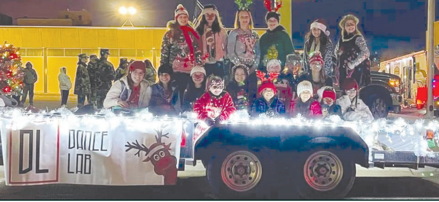
The Dance Lab had a lot of fun on their float during last year's Christmas parade.

The Christmas Parade is a Big Spring annual tradition. This year's theme is "Lights, Christmas, Action - Any Christmas Movie," which should make for an exciting time. Think of all of the holiday classics that can be made into a float. I hope that at least one float is made after the best Christmas movie of all time.... Die Hard . Okay, so let us get back to this parade. With the theme being any Christmas movies,