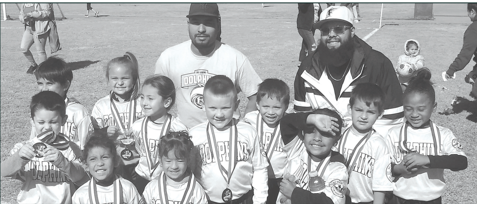
Pictured to the left is the age 6 & under dolphins of the Big Spring soccer club. The Dolphins, along with all the other teams, had a great season. All participants enjoyed learning the game of soccer and learning how to be a good competitor and an even better teammate. Soccer is always a good way to stay active and keep athletic. It is always fun to go out and see these kids try as hard as they can and give the crowd in attendance a fun show to watch