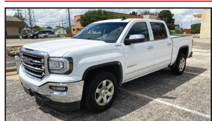
2016 GMC Sierra 1500 SLT 4x4 64k Miles $39,995