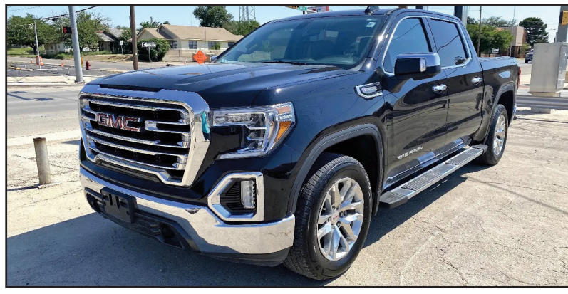
2019 GMC Sierra 1500 4x4 16k miles $59,995