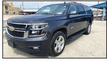
2017 Chevrolet Suburban LT 2WD 40k Miles $44,995