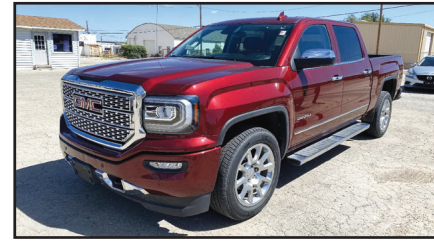
2017 GMC Sierra 1500 Denali 4x4 54k Miles $49,995