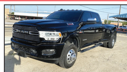
2019 Dodge Ram 3500HD Dually 4x4 Diesel 30k Miles $79,995