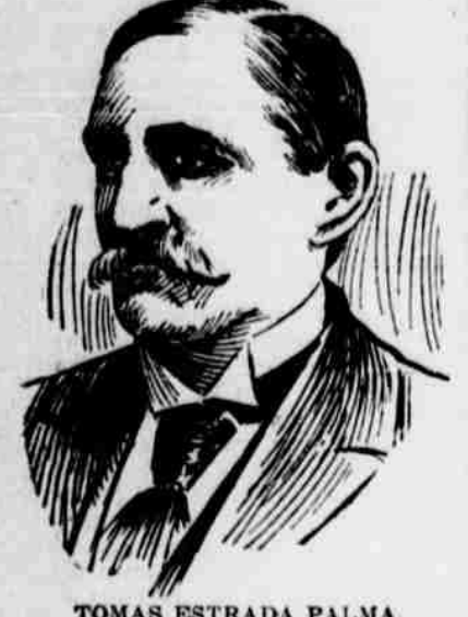
TOMAS ESTRADA PALMA. Tell. At the close of that strife he refused to swear allegiance to the king and exiled himself in Honduras...