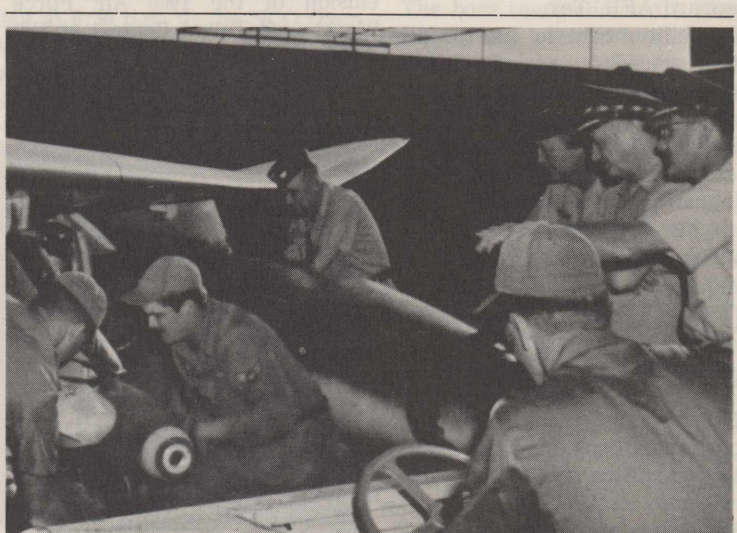
VIETNAM VISIT—General McConnell is shown being briefed on bomb loading procedures by then Lt. Gen. William Momeyer, 7th Air Force commander, during Republic of Vietnam visit.