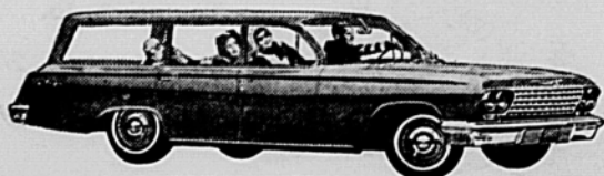
New Biscayne 4-Door 6-Passenger Station Wagon—lots of room and zoom