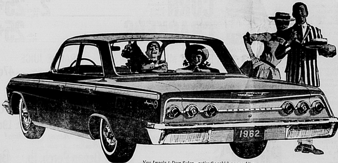
New Impala 4-Door Sedan—notice the rakish new roof line