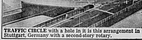
TRAFFIC CIRCLE with a hole in it is this arrangement in Stuttgart, Germany with a second-story rotary.