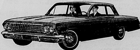
New Bel Air 2-Door Sedan—with beautifully crafted Body by Fisher

See the '62 Chevrolet, the new Chevy II and '62 Corvair at your local authorized Chevrolet dealer's