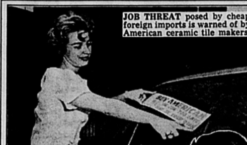
JOB THREAT posed by cheap foreign imports is warned of by American ceramic tile makers.