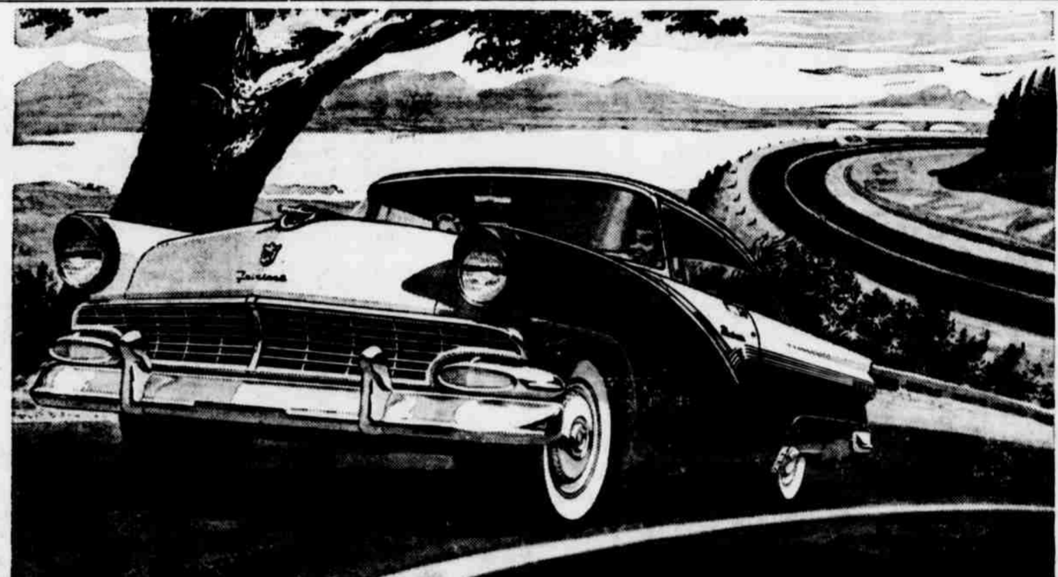
In a Thunderbird Special V-8 engine* 225 eager "horses" await your instructions *Available in Fordomatic Fairlans and Station Wagons

For the sheer fun of driving FORD goes first!