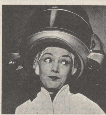
who spends $4.00 a week to have her hair washed and set

(She's distressed that her dentist had to replace two of her teeth recently as a result of gum disease . . . yet she still neglects to replace her worn-out toothbrush that is useless for gum massage.)