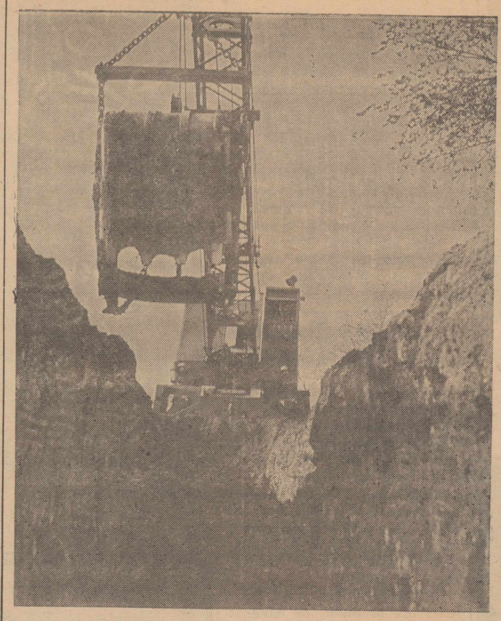
DIGGING—The large excavating crane, operated by Virgil Cook, civilian, clears away dirt to needed depth for an 18-inch storm sewer pipe.