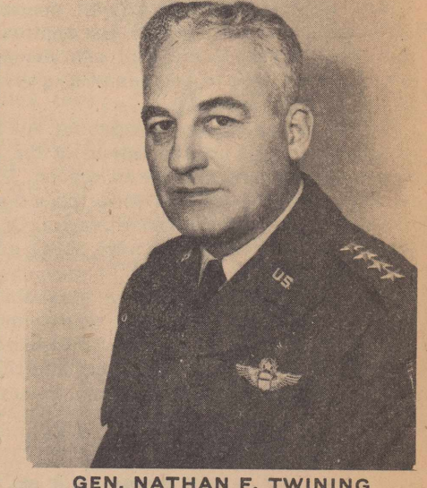
GEN. NATHAN F. TWINING

Following the graduation ceremony in the theater, the grad-uates will assemble on the flight (Continued on page 3)