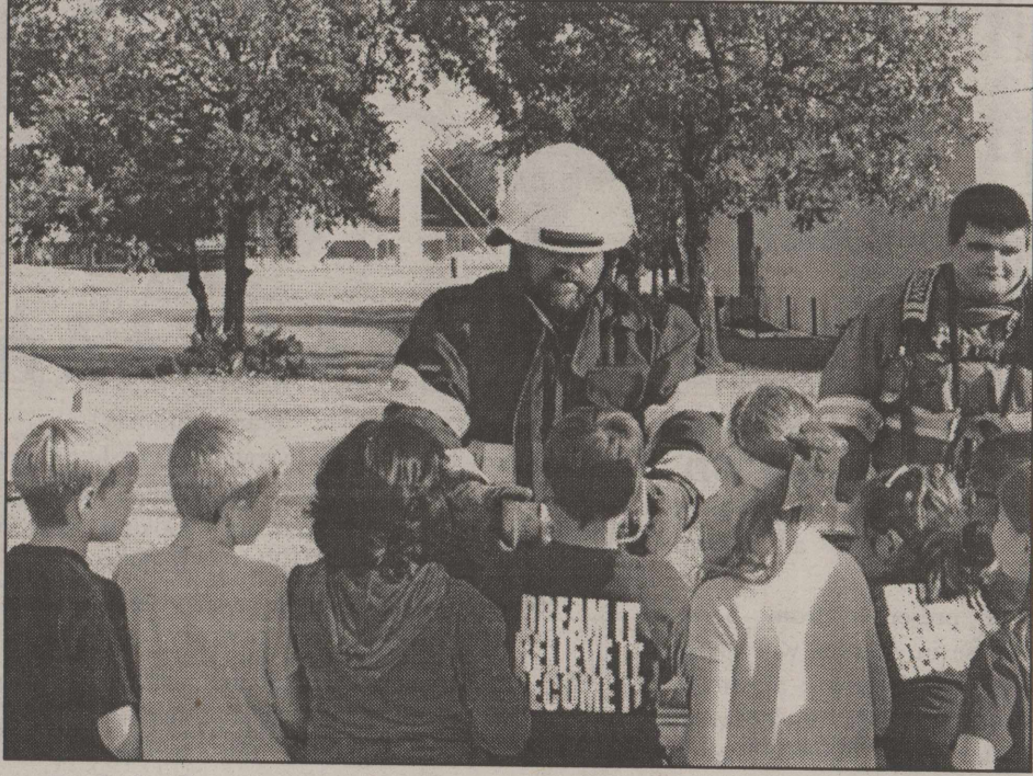
Fire Prevention! Members of the Bronte Volunteer Fire Department recently visited Bronte Elementary students for Fire Prevention Month. One of the highlights for the children was using the fire hose (left photo).