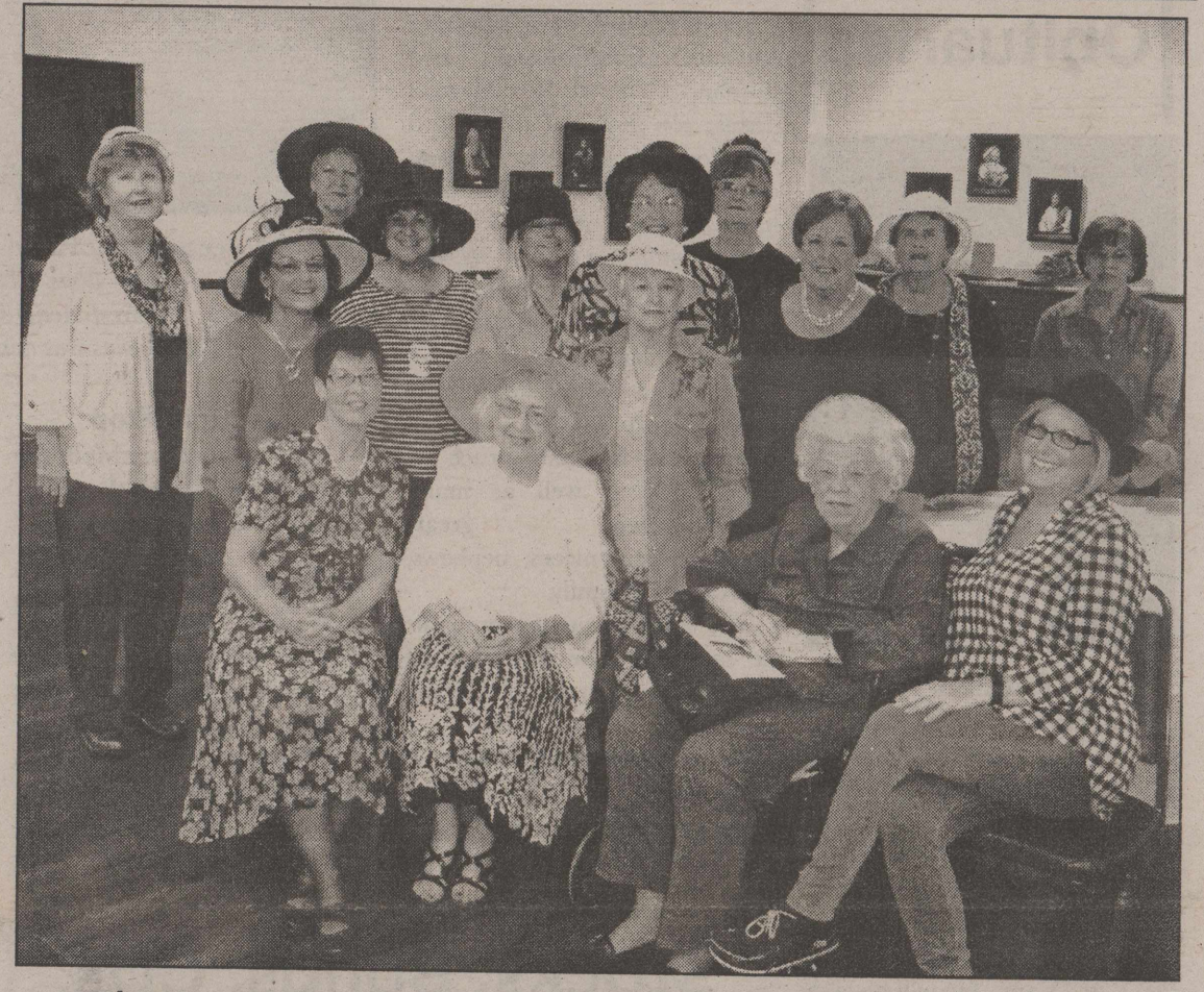
70th Anniversary Celebration! The Bronte Sorosis Study Club celebrated its Seventieth Anniversary on Thursday, February 16, 2017, at the Bronte First United Methodist Church.