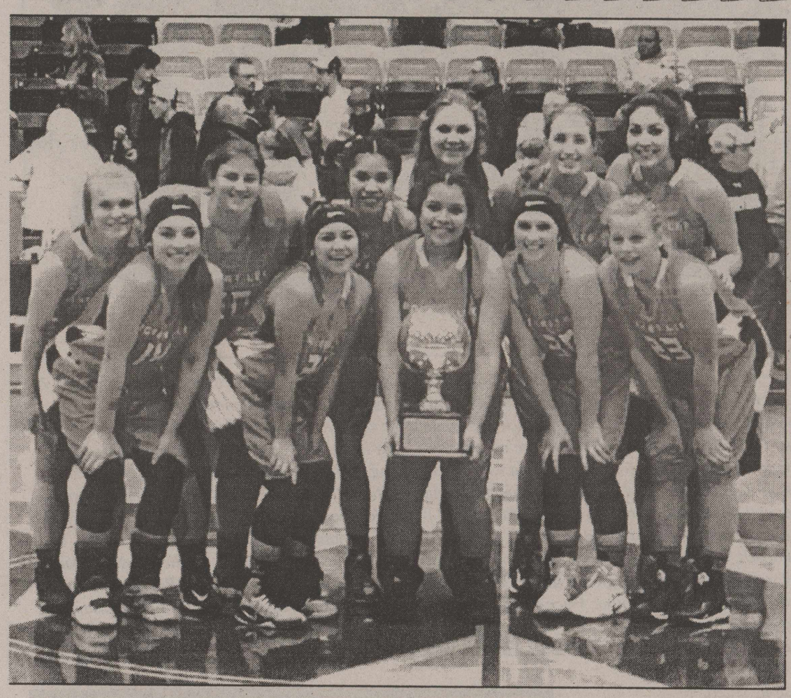
Lady Steers! The Robert Lee Lady Steers took the Bi-District championship by defeating the Rotan Yellowhammers 60-29 on February 14, 2017. This year's playoff run ended when the Lady Steers were defeated by the May Lady Tigers during the Area Round of the playoffs, 50-61.