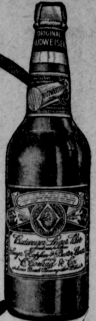
Corked or Tin Capped