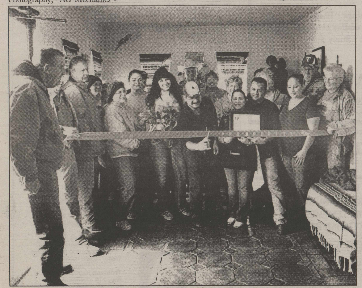
Ribbon Cutting! Members of Robert Lee's Vision with a Purpose recently assisted with a Ribbon Cutting celebration at Rangel's Restaurant in Robert Lee.

Requirements for filing for school board are that you must have lived in the state for one year and six months in the school district prior to filing, be at least 18 years of age, and be a registered voter at the time of election.