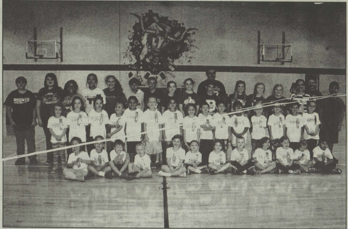
Stars! The future Stars Sports Day (Young Athletes Programs), offered through SOTX, Special Olympics Texas, was held at Bronte Elementary on Friday, April 3. Pre-K and Kindergarten students participated in this special event.