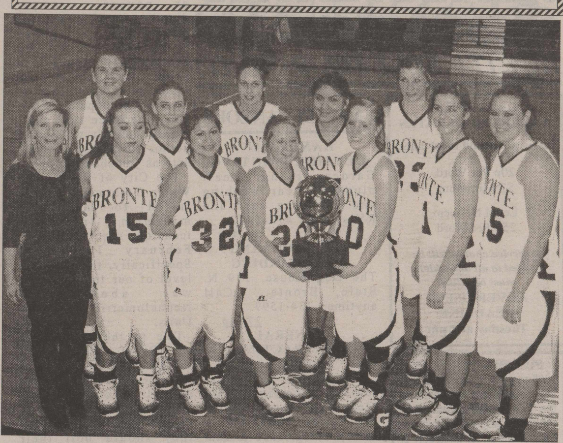
Lady Longhorn Basketball! The Lady Longhorns defeated Marathon 75-45 for the area championship. They fell to Highland Tuesday evening, February 22, at the Junell Center in San Angelo to end their season.

Burrito, Spanish rice, pinto beans, cake, milk