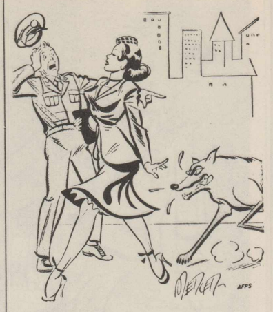
"So there's a wolf following me! So what?"